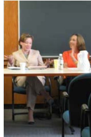
Women in Public Policy Panel